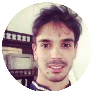
IGNACIO CARTES SANTIAGO